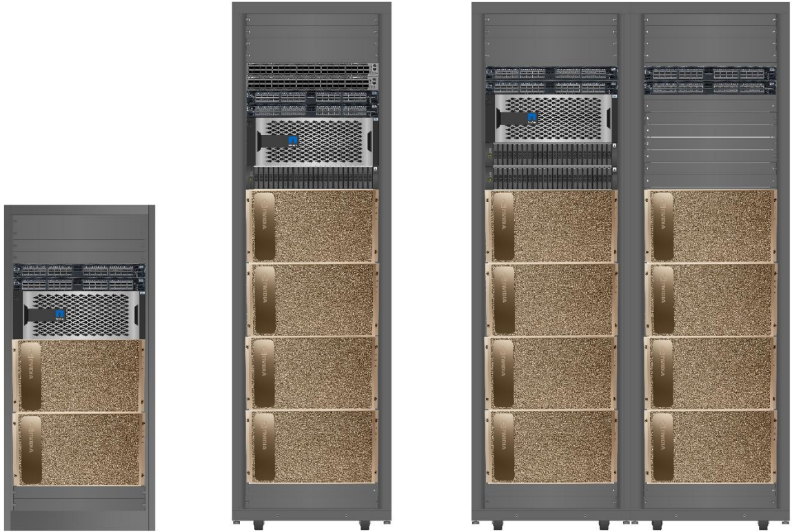
Figure 1) NetApp ONTAP AI family with NVIDIA DGX A100 systems.

The number of DGX A100 systems and AFF systems per rack depends on the power and cooling specifications of the rack in use. Final placement of the systems is subject to computational fluid dynamics analysis, airflow management, and data center design.