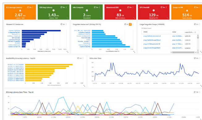
Figure 1: Infrastructure usage dashboard.

As a cloud-led, data-centric software company, only NetApp can help build your unique data fabric, simplify and connect your cloud, and securely deliver the right data, services and applications to the right people—anytime, anywhere. www.netapp.com