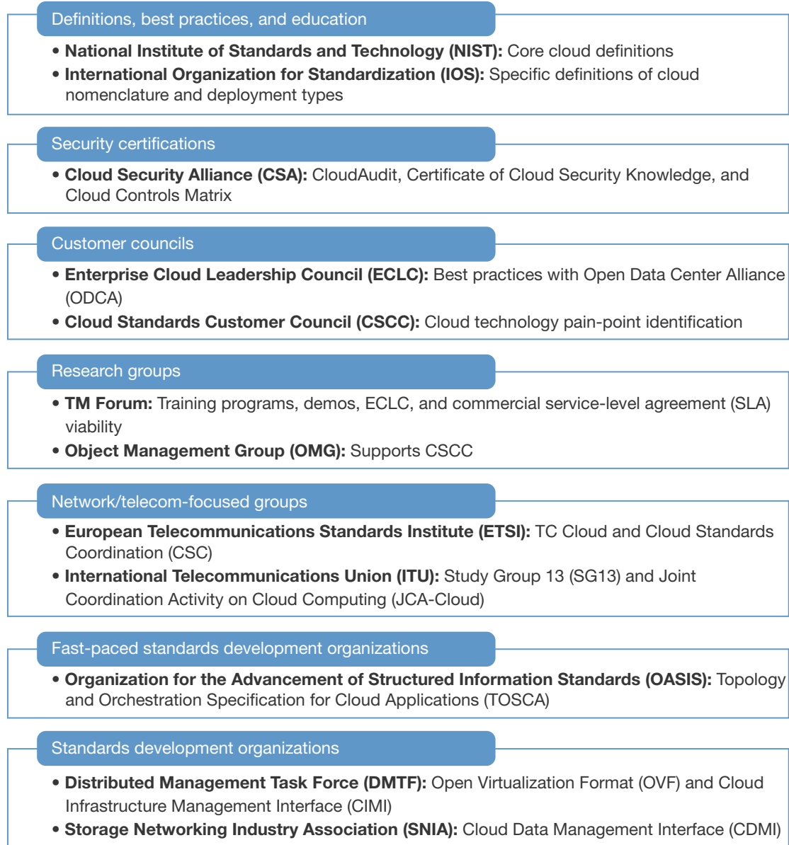
FIGURE 1 Standards-Focused Organizations And Current Projects

Standards Bodies And Open Source Foundations Learn To Play Nice