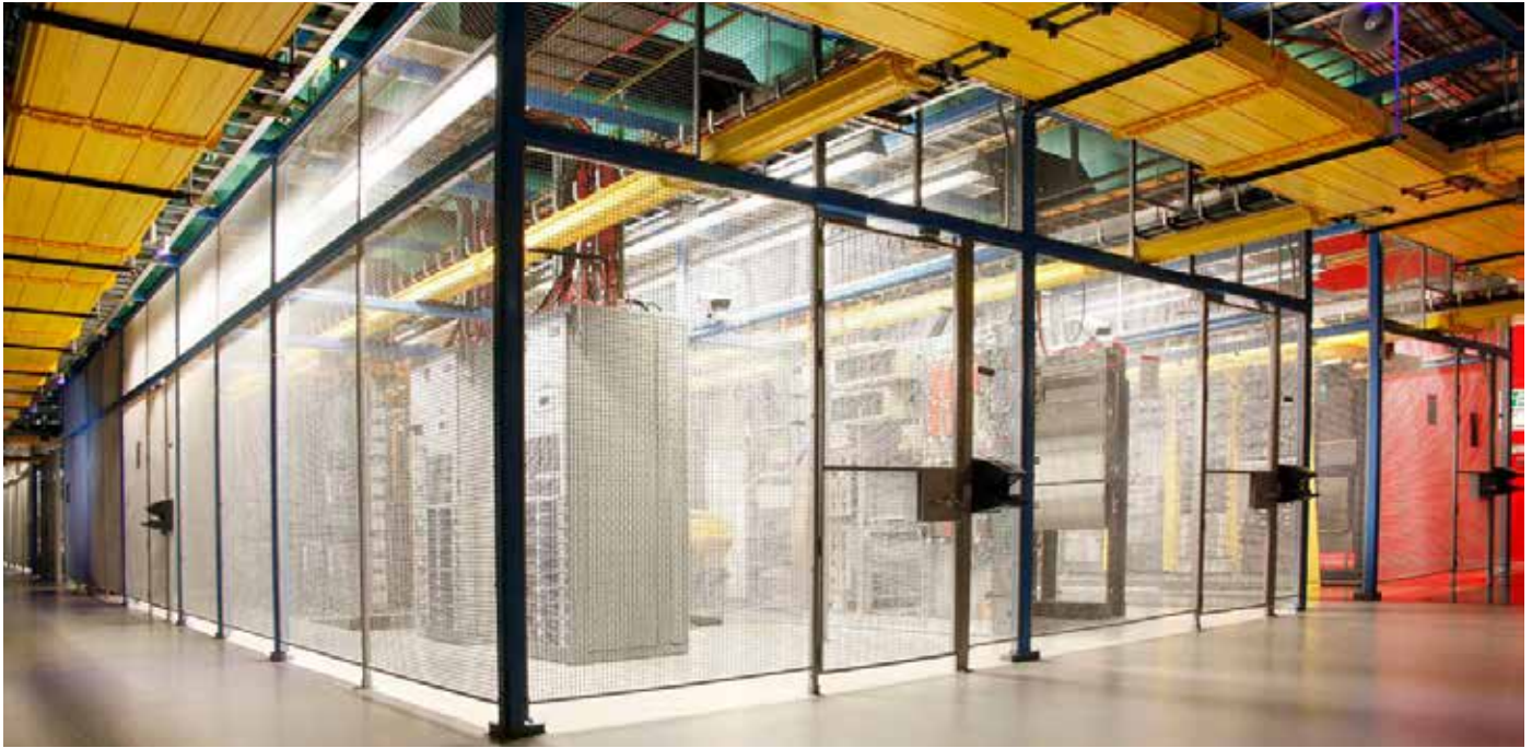
Figure 3) Your NetApp systems are physically deployed in racks located within a cage in an Equinix data center. The minimum is two nodes for high availability.