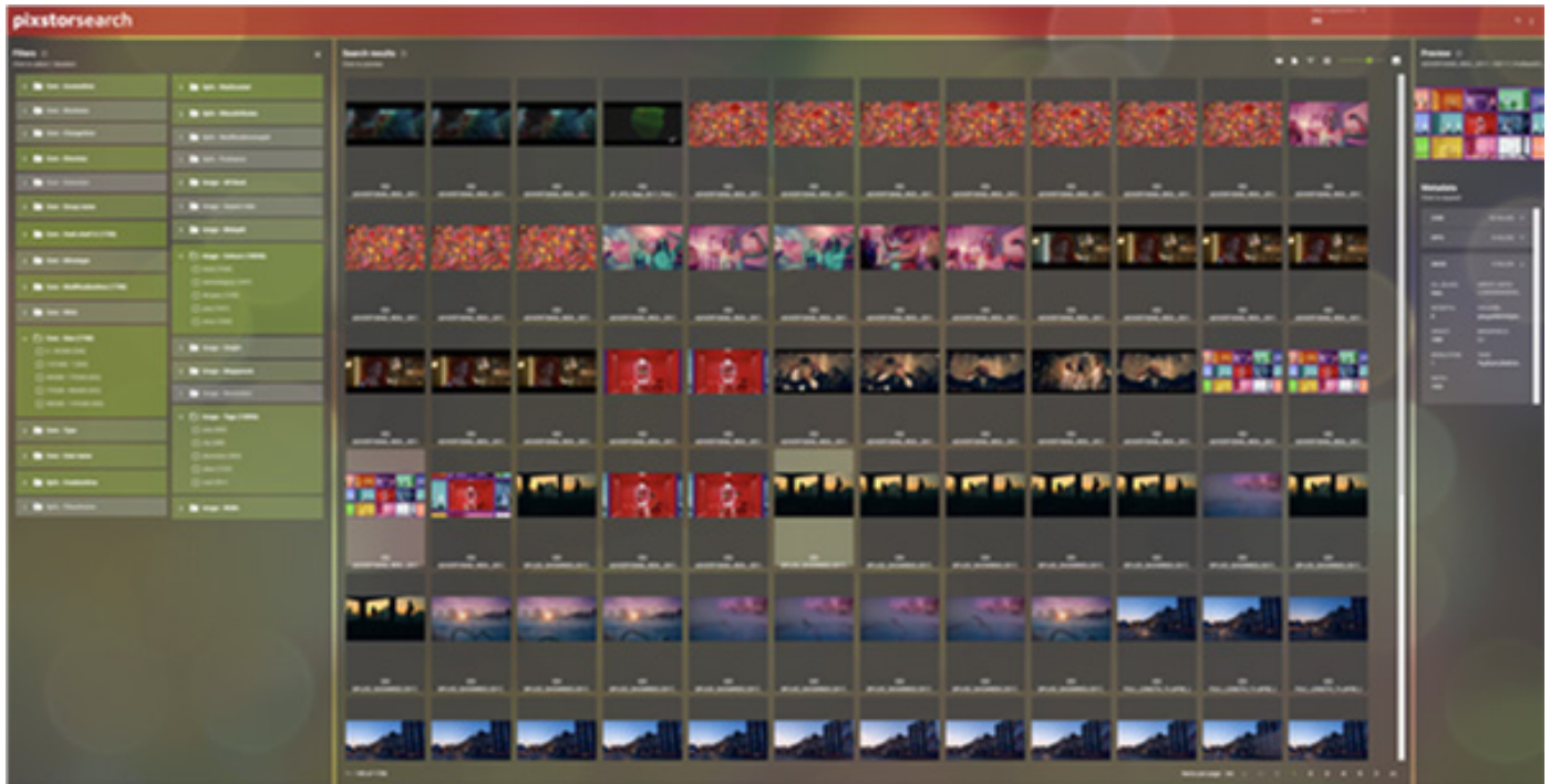
Figure 2) PixStor Search simplifies media management with an intuitive web interface that enables users to easily find, view, edit, and archive content.