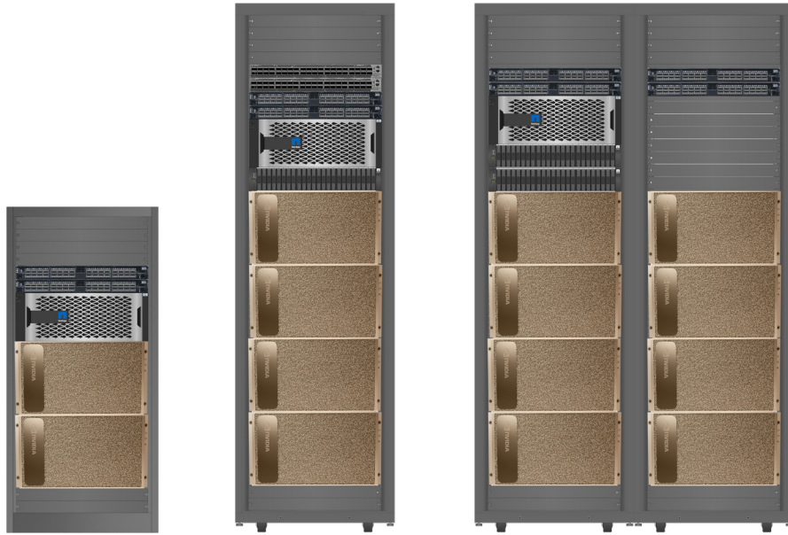
Figure 1) ONTAP AI architectures using DGX A100; 2-, 4-, and 8-node configurations.